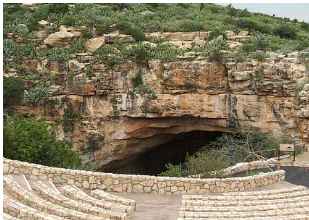
Entrance to Carlsbad Caverns.