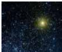
Plewa Studies the Stars