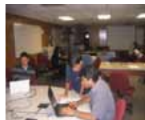
Grad Students & Post Docs

I've moved my usual missive to the front page because of a very big and exciting development: at its November meeting, the Florida State University Board of Trustees approved the implementation of the B.S. degree program in Computational Science!