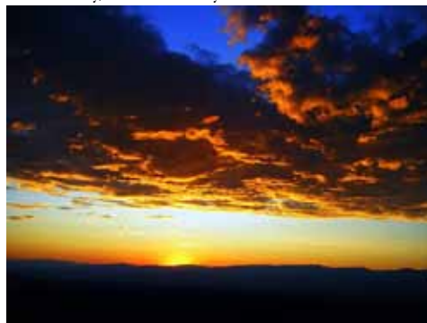
Los Alamos morning sky.